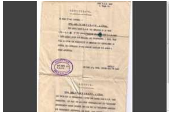
Figure2. To detect the text stroke and background estimation in degraded document image.

Variational Bayesian methods, also called ensemble learning, are a family of techniques for approximating intractable integrals arising in Bayesian inference and machine learning. They are typically used in complex statistical models consisting of observed variables (usually termed "data") as well as unknown parameters and latent variables, with various sorts of relationships among the three types of random variables, as might be described by a graphical model. As is typical in Bayesian inference, the parameters and latent variables are grouped together as "unobserved variables". Variational Bayesian methods can provide an analytical approximation to the posterior probability of the unobserved variables, and also to derive a lower bound for the marginal likelihood of several models with a view to performing model selection. It is an alternative to Monte Carlo sampling methods for taking a fully Bayesian approach to statistical inference over complex distributions thatare difficult to directly evaluate.