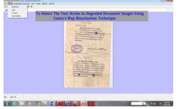
Adjust The Brightness Level Then Click Ok.